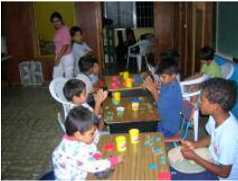
The children love to play with play dough