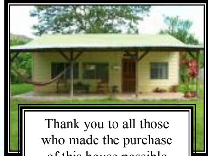
Thank you to all those who made the purchase of this house possible

I am excited about the coming year. We have many projects planned that will be such an improvement to the orphanage. We have someone coming in February to redo the plumbing system. Also, a very dear friend has donated a water filtration system that will be installed this year. This will make the water drinkable so that we will no longer have to buy bottled water. This will be a blessing.